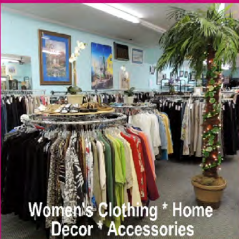
Women's Clothing * Home Decor * Accessories

Celebrating 20+ years of service to North Myrtle Beach & SOS