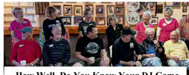
How Well Do You Know Your DJ Game