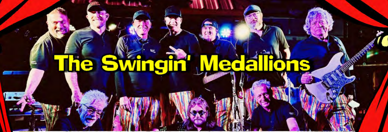
The Swingin' Medallions