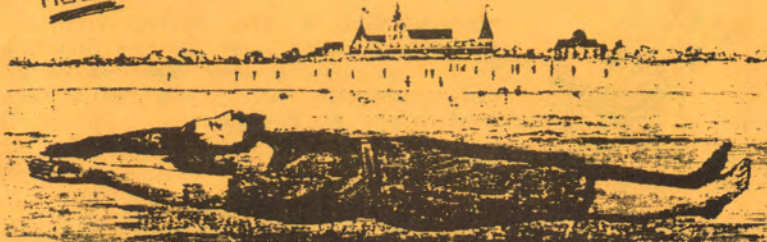
S.O.S. 1983 MEMBERSHIP APPLICATION

'83 SOS CARD INCLUDES SPRING FLING & FALL MIGRATION